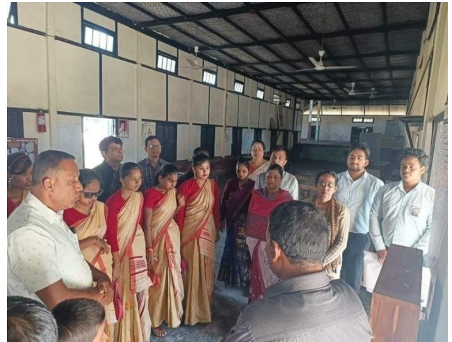
International Day of Person with Disability celebrated in Bahrapur Sankar Mission Blind School