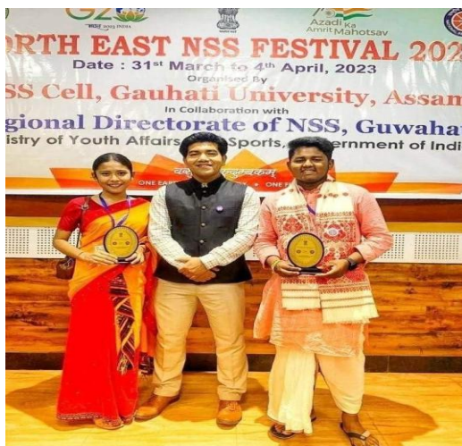
Volunteers of NSS Cell, ADP College participated in North East NSS Festival between 31 st March- 4 th April, 2023