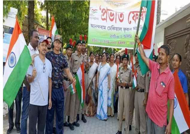
PRABHAT PHERI Programme on 12th August 2022 in City Area, Nagaon, Assam