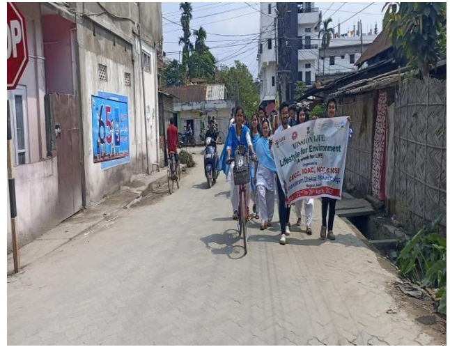
Mission Life, Lifestyle for Environment programme on 24 th March 2023