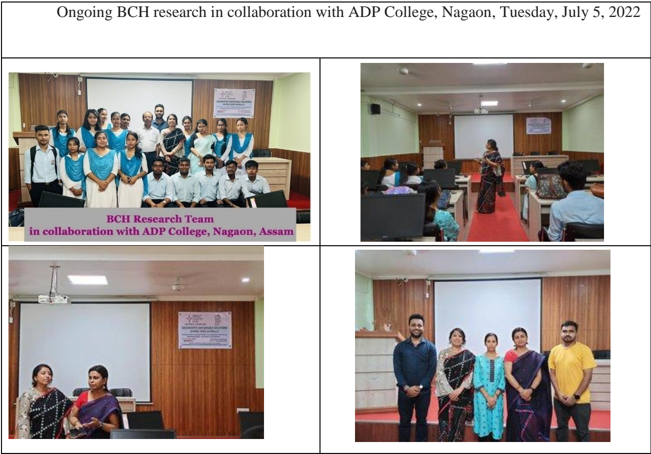
Workshop on Research Methodology & Discussion - Ongoing Breast Cancer Hub (BCH) Research Project in Collaboration with Anandaram Dhekial Phookan College (ADP College), Nagaon, Assam,