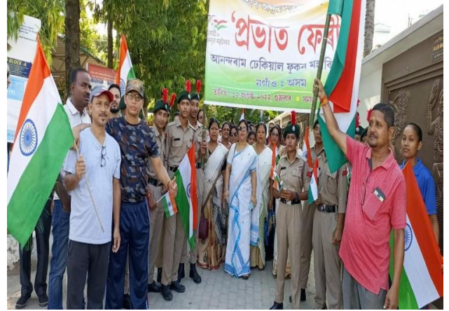
ADP College in Collaboration with NCC Unit, 8 Assam Bn Army Wing Organised PRABHAT PHERI Programme on 12th August 2022 in City Area, Nagaon, Assam.