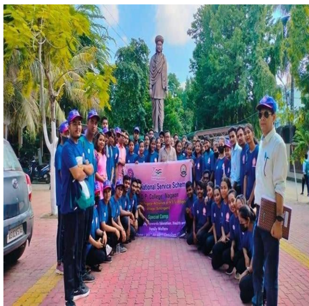
Volunteers of NSS Cell, ADP College participated in North East NSS Festival between 31 st March- 4 th April, 2023, in collaboration with Regional Directorate of NSS, Guwahati.