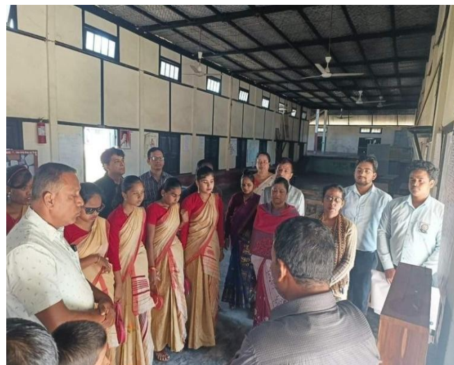
International Day of Person with Disability celebrated in Bahrampur Sankar Mission Blind School by NSS Unit of ADP College