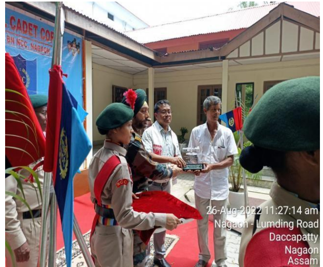
26-Aug-2022 11:27:14 am Nagaon - Lumding Road Daccapatty Nagaon Assam