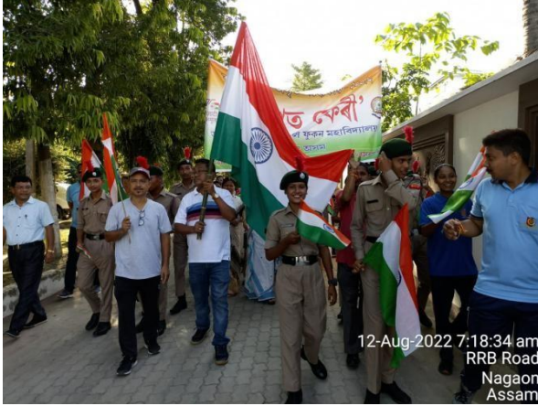
12-Aug-2022 7:18:34 am RRB Road Nagaon Assam