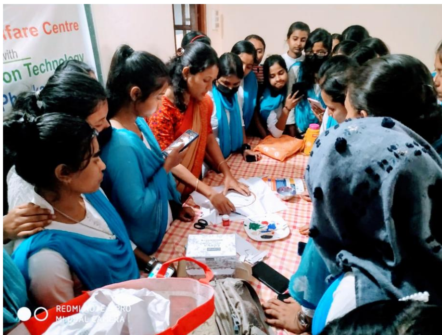
Training workshop on Hand Embroidery and Fabric Painting