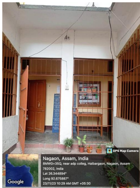
CCTv installed in Girls' hostel