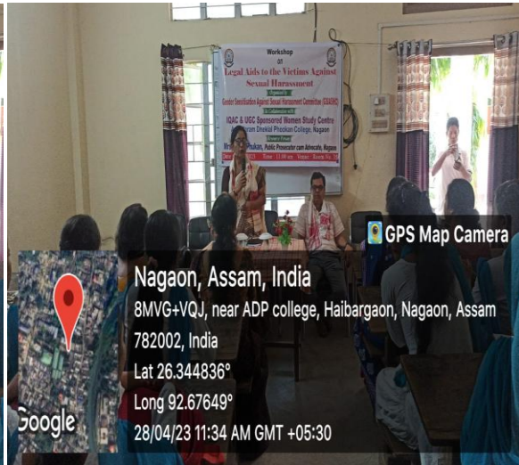
Workshop on Legal Aids to the victims against sexual harassment