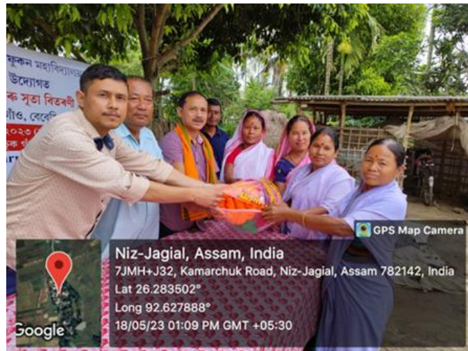
Weaver's Awareness Camp