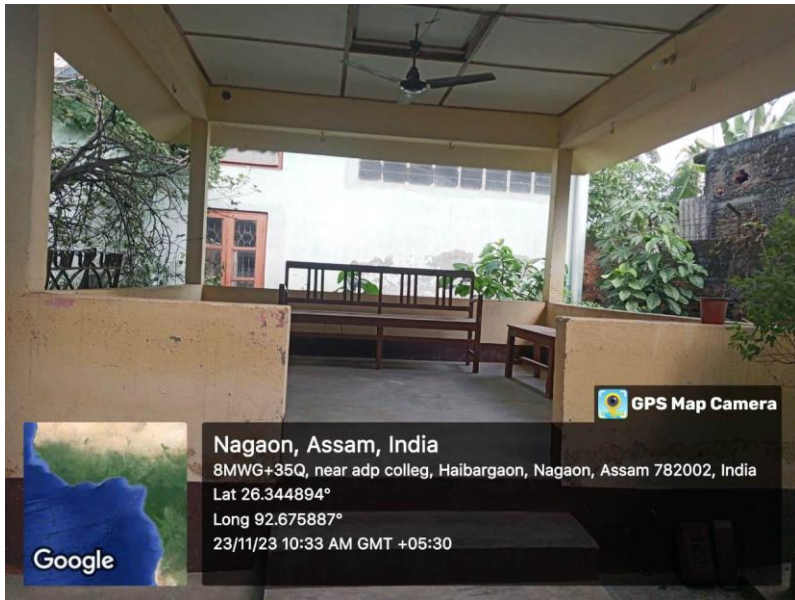
Visitor's waiting room in Girls Hostel

Hayang Principal AD.P. College Nagaon (Assam)